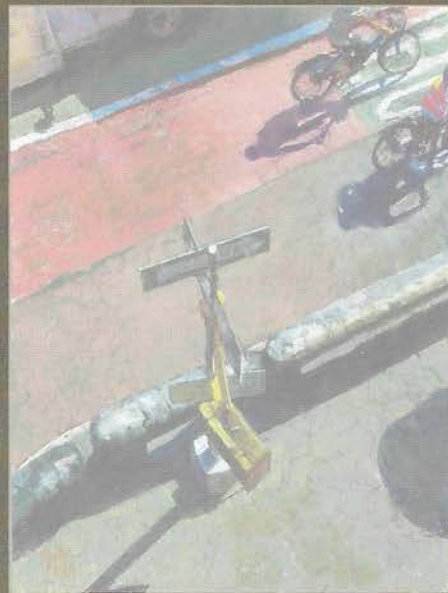
(FAR LEFT) TONY ARMENDARIZ (b. 1964), Ravenswood , 2022, watercolor on paper, 16 1/4 x 4 1/2 in., available through the artist ■ (TOP) POPPY BALSER (b. 1971), Canoe Conversations , 2022, watercolor on paper, 12 x 16 in., available through the artist ■ (MIDDLE) NANCIE KING MERTZ (b. 1952), Passing Fancy , 2020, pastel on sanded paper, 24 x 18 in., Art de Triumph (Rockford, Illinois) ■ (BELOW) SARAH WARDA (b. 1967), The Ferry Ride , 2023, oil on canvas, 18 x 24 in., Gallery 33 Contemporary (Chicago)